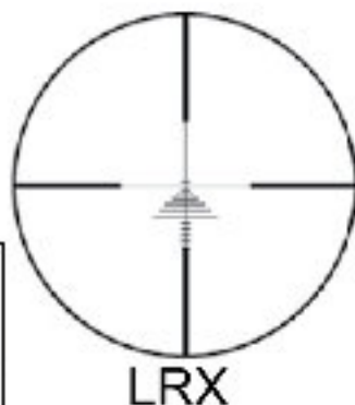
LRX Reticle Measurements in Inches and Yards.

The photo at the left shows a fox correctly ranged at 300 yards using a .243, 70 gr. HP bullet. A 10 mph crosswind is also corrected, using the LRX crossbars.